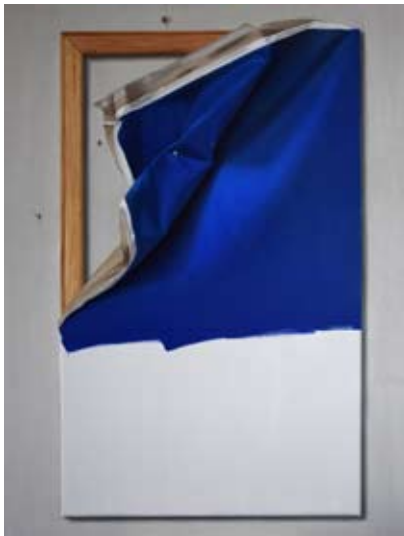
Canvas II Oil on canvas 180x140 cm 2018