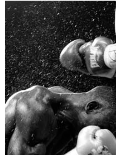
Tribute Photography 118,9x84,1 cm 2017

The image is part of a short-story included in the 'Photo-Scripts' project (which includes 14 independent short stories with differentiated themes) currently on display at the Museum Collection Berardo in Lisbon, Portugal. This short-story is titled "Tribute" and consists of a set of 8 photographs and a fictional text. The concept of 'Photo-Films' includes images and fictional texts. This short-story, in turn, is the embryo of a book that will be published later this year, centered on a boxing match that took place in Macau on 28 October 2017, between a Ghanaian fighter and a fighter from People's Republic of China, who won the disputed intercontinental title (IBF I/C Light Heavyweight Championship). This image is part of a series of photographs that, precisely, intends to honor the Ghanaian fighter who lost the combat, and the accompanying text is a fictional micro-story that is an integral part of this work.