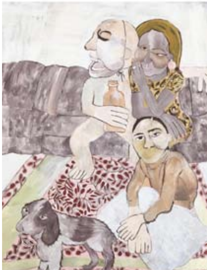
La fin de soirée Mixed technique 350x120 cm 2018

This large acrylic on leather represent a party ending. The protagonists are all reunited together but don't specially communicate. Some of them are sad, others completely mute and lost in their minds or influenced by the drinks they took previously. They were probably more one or two hours before but it is started to be late and others guests went back home. They are now conditioned in small committee, in a sort of huis clos. This white space they are standing in doesn't have limits but is clearly cut from the rest of the world wich is at the same time peaceful and a bit scary. This people are now ready to show their true nature, the sexual, aggressive or bestial part they have in them, without the heavy look of the society for judge. This work questioned different things such as the real meaning to live in an era where the social relations took such a major part. Are they so useful and safe for us , would not it be better to be invited nowhere?