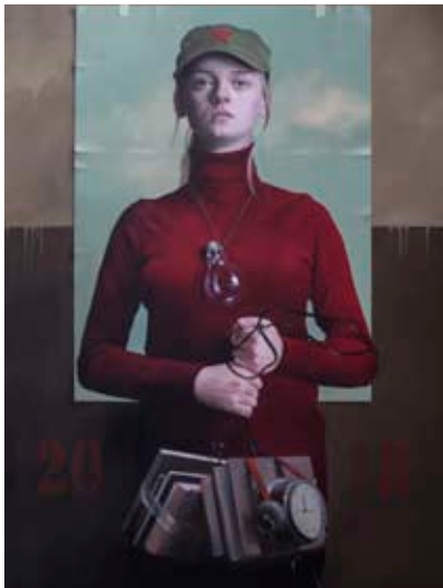
Il futuro è rosso Oil on canvas 146x89 cm 2018

This is a contemporary metaphor of a soc-realistic art that was dominating the eastern world for many decades. It was inspired by the bygone era where the ideology was driving the daily life of the ordinary people. Its making was influenced by the universal struggle to break up the chains of idealism and the eternal yearning for freedom.