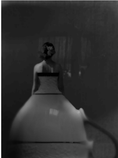
filiżANKA (A cup) Photography - Mixed technique 40x60 cm 2017

The title of the photograph is "filiżANKA" ("a cup"). At first glance the picture shows a woman dressed in a white ball dress, looking into the distance, through the window. However, after a while we see that this is not a dress, but a cup. The woman becomes objectified. Living body is merged with the object. In this juxtaposition the features that link femininity and porcelain are being highlighted - fragility and delicateness. In Polish the word filiżANKA contains in it the name ANKA, the augmentative form of the name ANNA, which additionally highlights the ambiguity of the montage photo. The work is a question about the essence of femininity.