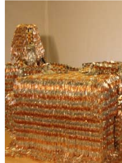
Rendez-vous Sculpture 118x153x80 cm 2017

It is a work made with 172,000 paper clips. My frame is a table and 2 wooden chairs on which I arranged my wire frame and hung the paper clips (about 13 trombones per square of wire).