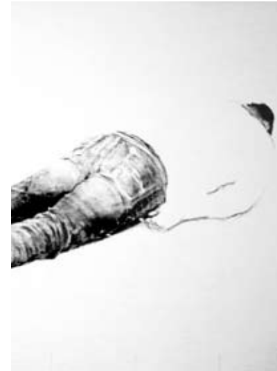
n°18 Oil on canvas - series "Fantoches" (Puppets) 92x65 cm 2017