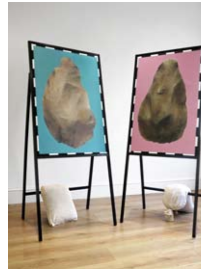
Universal Languages Installation, Mixed media, oil on canvas on custom wooden support and builders fabric pillows. 156x60x50 cm 2018

This work is a proposal for a painting-based installation consisting of two construction work-like structures in which two oil paintings will be placed. Installation, Mixed media, oil on canvas on custom wooden support and builders pillows.