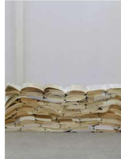
Gaps Installation 130x100x30 cm 2018

Exploring the gap between pages of a book, I built a wall as one body by using its gaps. I overlapped pages of several books, one page after another. It expresses the desire that "I" want to fill the gap between "someone" and "I". And also "I" want to satisfy and share her/his internal space with "someone". This work is one of three work for the series "Gap".