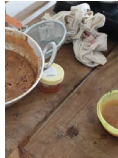
icmfspbpce Video Installation - Various materials 2016

The field of science has influenced me. I desired to a scientist, I could not. The scientific process is time taking, my science is rather 'easy science'. Perhaps I liked the result more than the process of science. The work explores multiple meanings. Forms of artefacts here assumed atoms. I realized these artefacts keep coming on my colour palette. Due to congested place (Living life-space in India), many times I mix with these colours. First, I felt an emotion of hatred, with that mixing. But later realized and pondered, what is the relationship between these objects and me? Why is this thing staying with me and why being in every universe for life? Then I started looking at it in a metaphysical way. When I get into these objects, explore from atom to atom. There I am astonished, I am right there in front of me (my beauty and my happiness). I am not only in these objects but also in every object of this universe and conceptually in every universe and in different combinations.