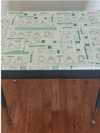
Standardized Testing Mixed Medium: Paper 60x62x46 cm 2018

This work addresses standardized testing in public schools. The use of standardized testing has grown exponentially in the United States since 2002's No Child Left Behind Act mandated testing in all states. Opponents of standardized testing argue that the focus on accountability has subsequently created a shift in teaching to the tests. This includes a narrowing of curriculum and use of instructional methods that emphasize skill and drill, rote memorization, and strategies to game the test. Programs for the arts and electives in schools are often cut, leaving little creative outlets for students. Painter's use of scantrons highlights the emphasis on standardized testing and data collection in public education. The desk is one in an arrangement of 25 desks in rows, mirroring the layout of a classroom for testing. The repeated use of the word data brings attention to the narrow view of students as test scores and data points.