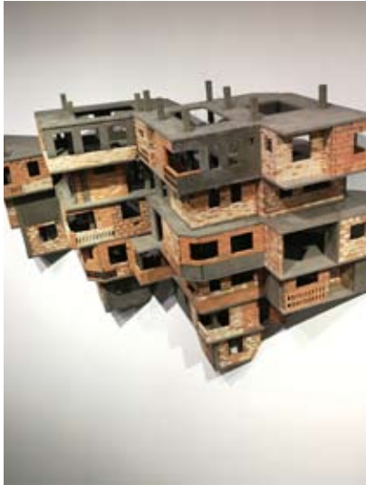
Peripheral Integrations Assembly and masonry 140x70x50 cm 2018

The following proposal is what I consider a continuation, or rather, a feature of the work. I've been undertaking in recent years; Local Memories, as I initially called it in its first stage in 2014, was approached from traditional engraving, being this a creative process that begins by observing my immediate environment (the city of Bogota, locality of Engativa) and investigating the social relations established from architecture relative to its inhabitants and their environment, in principle approached from a wistful viewpoint, which later gave way to the research and understanding of how these relations were linked to the economic and political conditions that foster these settlements, colloquially defined as popular neighborhoods which, in some cases, develop from informality and even illegality and are closely related to this self-construction phenomenon.