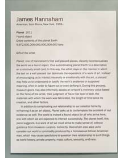
Planet Rhetoric on foam board. 24"x36" 2011

The piece consists of a 24"x36" didactic contextualizing the entire planet as a found object that is the work of the artist.